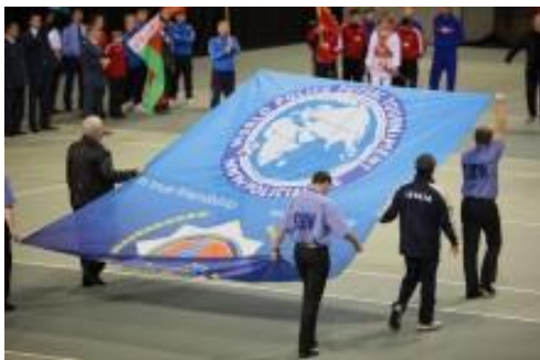
IPA and Polician flag

The tournament follows exactly the same rules as the ones of the IPA and provides the perfect platform for IPA members as well as future members: to create friendships for life, which also adds positive aspects to work relationships between police forces.