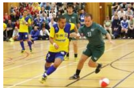
IPA Brazil and IPA Slovenia teams

70% of the participants are registered IPA teams, and countries ranging from Algeria to the United States saw "the world play in Belgium".