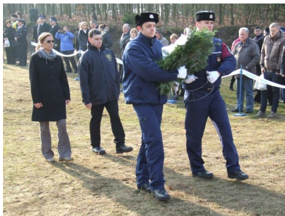
IEB representatives at the wreath laying

The following morning, all guests were transported to Jászszentandrás for the wreath laying at the Arthur Troop statue. The Hungarian pálinka and mulled wine offered to our guests helped counteract the cold weather. Before the main event, everyone had the opportunity to visit the Museum for the History of the Hungarian Police where historical police uniforms were on display.