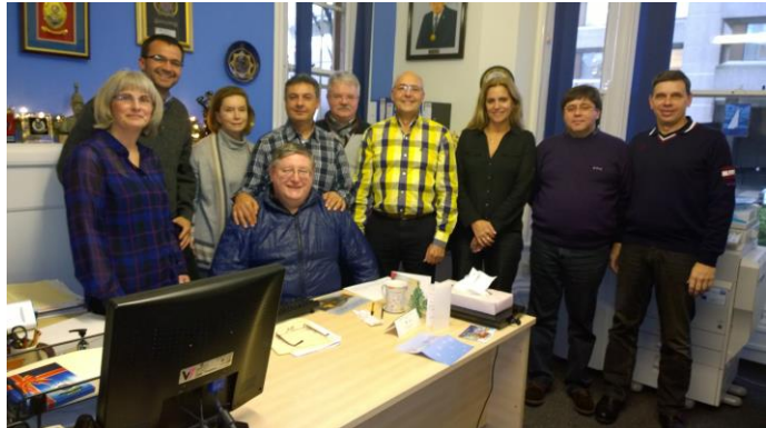
The IEB gathered at the IAC