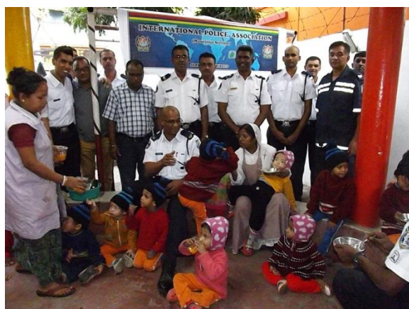
IPA Mauritius members at the Mother Teresa Centre

I have the honour and privilege to share with you a glimpse of the social activities conducted by IPA Mauritius members with the support of the Mauritius Offshore Patrol Vessel (MOPV) crew 'BARRACUDA' presently in Kolkata, India. Both the President and the Assistant Treasurer of IPA Mauritius presently form part of the commissioning crew of the MOPV. We are pleased to state that the following social activities were carried out during the month of January, thus displaying our association on an international platform while on official duty.