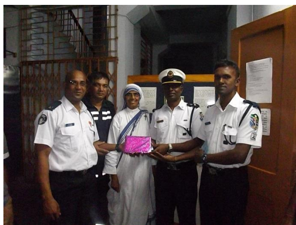
Accepting a token of appreciation

On 2 Jan 2015, IPA members, with the guidance of the Commanding Officer of the Barracuda and with the support of the crew, generously contributed towards the distribution of food to the Nirmala Sishu Bhawan which is an active and recognised branch of the Mother Teresa Centre. The home gives shelter to around 100 children aged 0-12 years, who are well taken care of by the sisters therein and by benevolent visitors (local & foreign). All those present have indeed shown compassion in bringing smiles and joy, and it was disheartening to leave all of them after a few hours filled with memorable moments. We realise that our presence has contributed only in a very humble way, and no-one can replace the sisters in the heart of these innocent children who have been abandoned by their own parents.